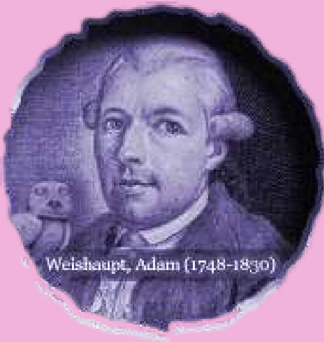
Weishaupt, Adam (1748-1830)